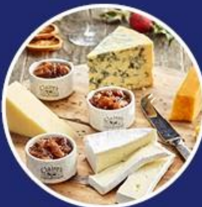
Handmade local produce