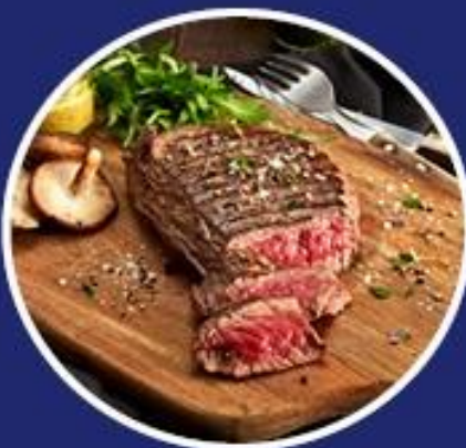
Locally sourced meat

Fresh meat, fish, frozen produce, fruit & veg and groceries