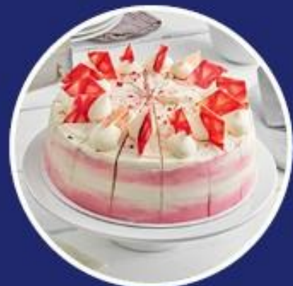
Own brand quality products

Pioneer Foodservice Montgomery Way, Rosehill Estate, Carlisle, CA1 2RW 01228 403410 www.pioneerfoodservice.co.uk