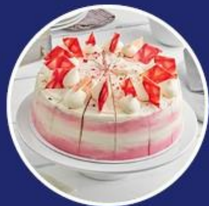
Own brand quality products

Pioneer Foodservice Montgomery Way, Rosehill Estate, Carlisle, CA1 2RW 01228 403410 www.pioneerfoodservice.co.uk